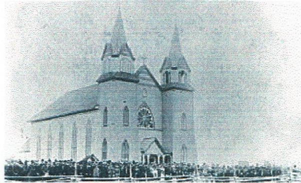
St Columba Church before 1917 Fire