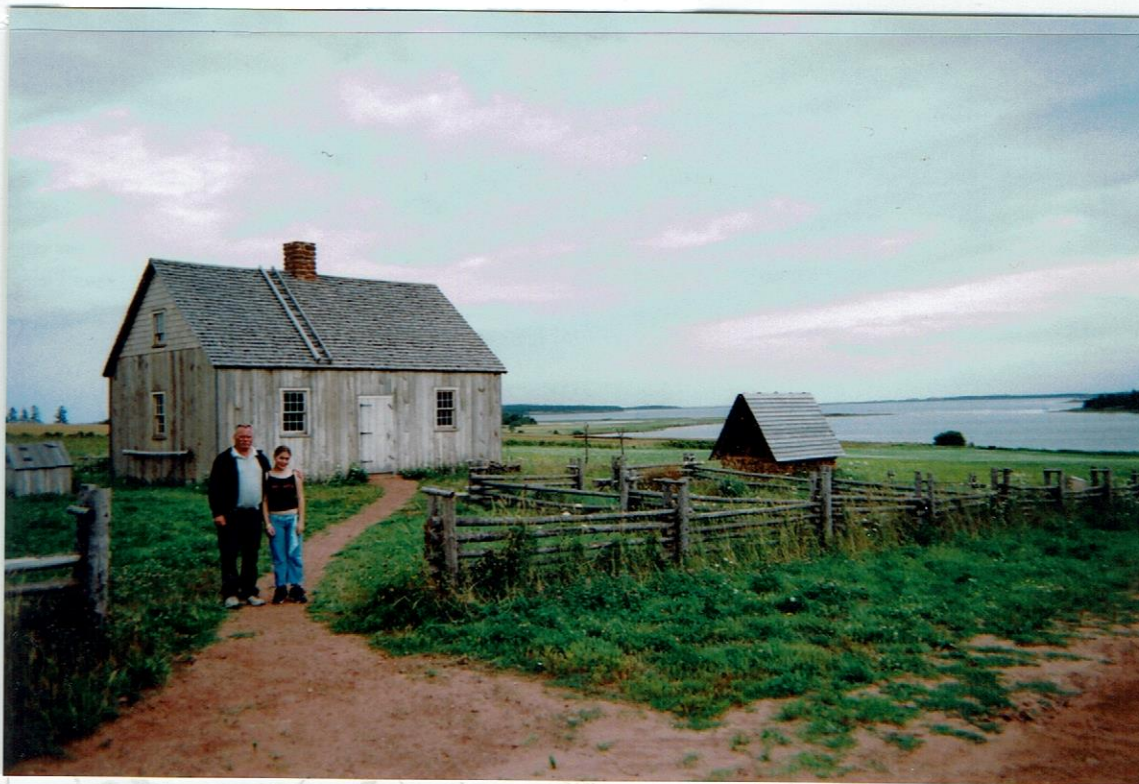
The Doucet House Rustico, Built 1768