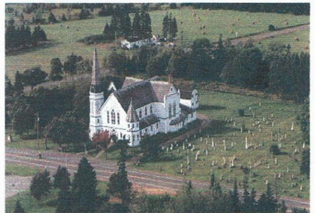
St. Alexis RC Church, Rollo Bay (rebuilt 1930)

A new church measuring sixty feet by forty two feet was built in 1853 on the site of the present church. In 1860 a tower and sacristy were added. (It is on this occasion that Saint Alexis acquired the venerable relic from Morell in exchange for a new bell.)