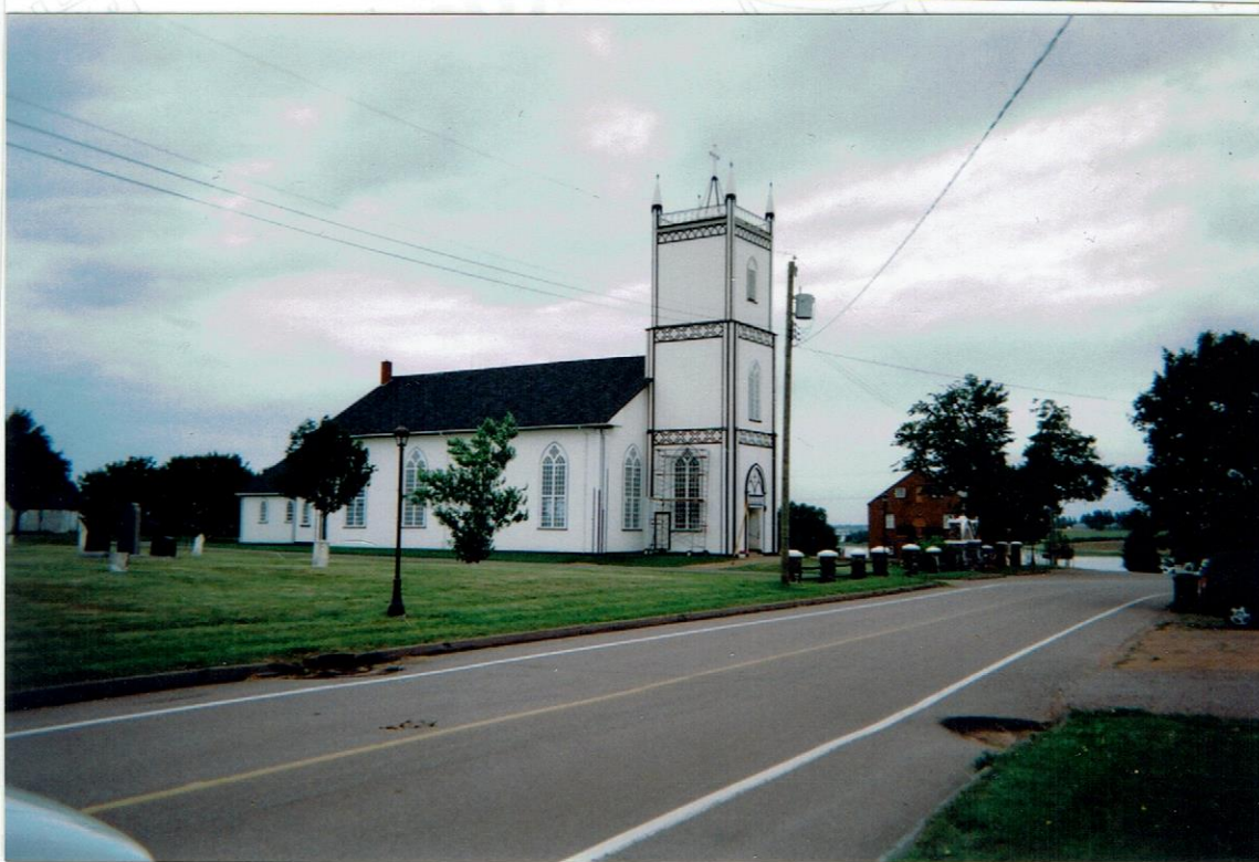
St. Augustine RC Church Rustico, Built 1834