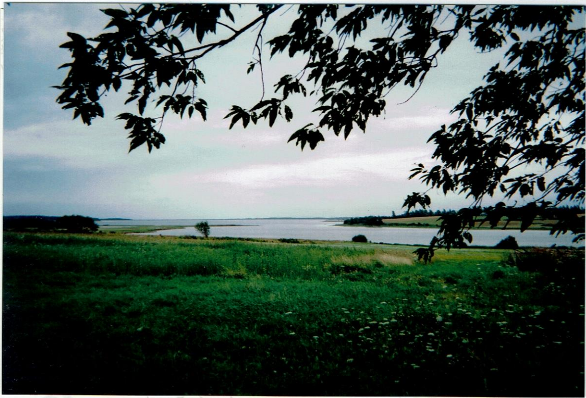
View of Fortune River From Pioneer Cemetery