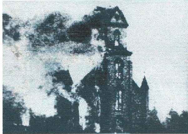
St Margaret's Church Fire June 10, 1921