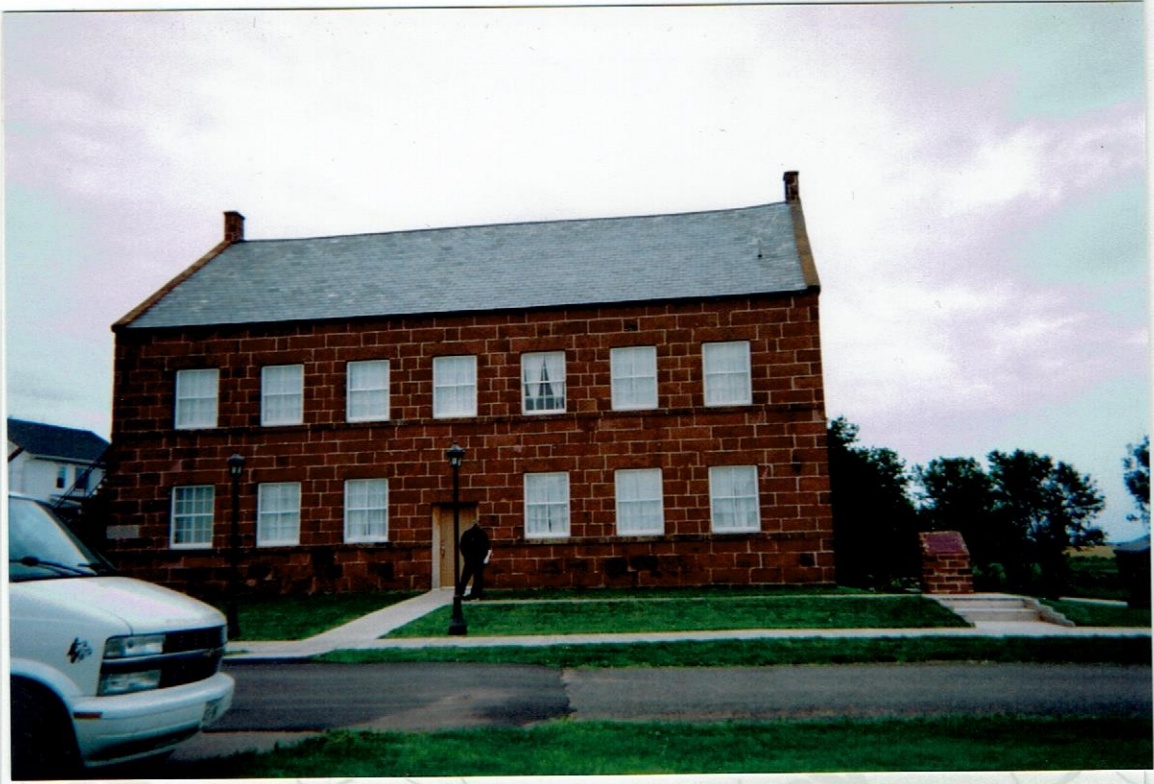
Farmer's Bank, Rustico Built 1861