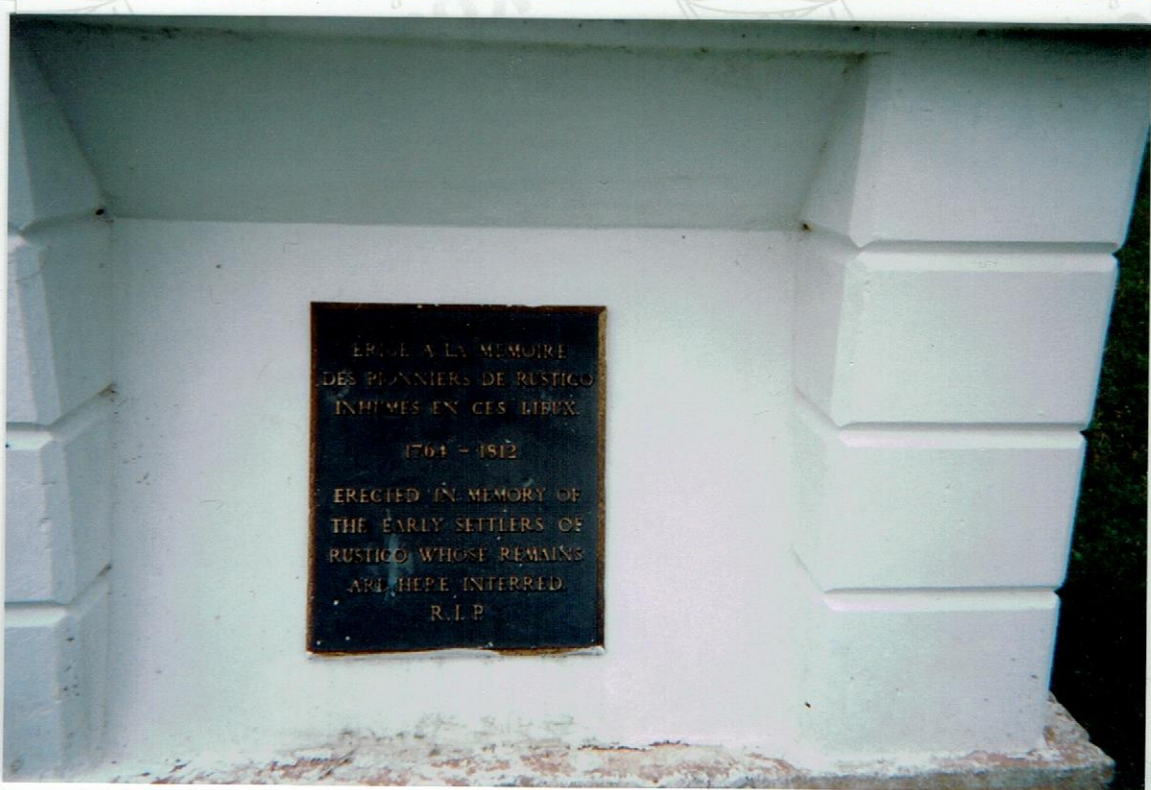
Close Up of Monument Rustico Pioneer Cemetery