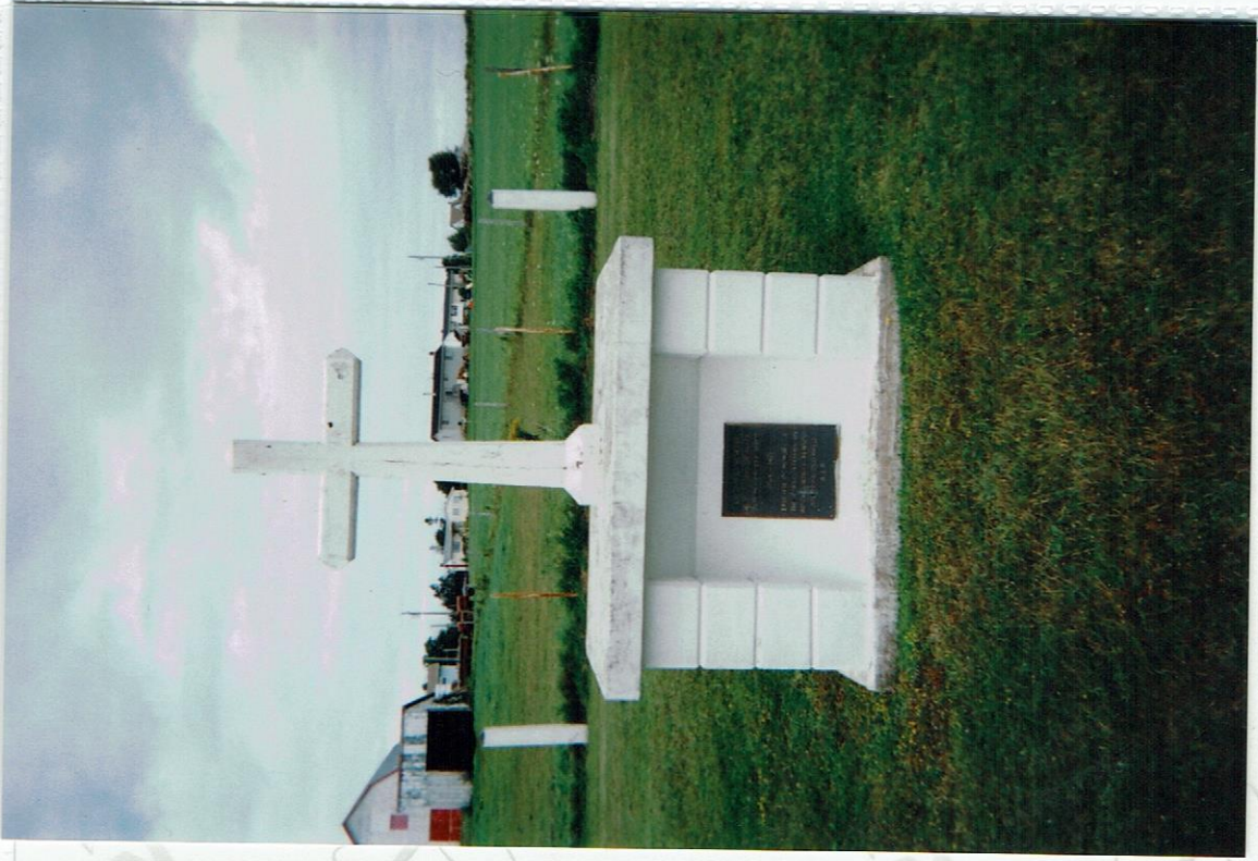
Monument Rustico Pioneer Cemetery