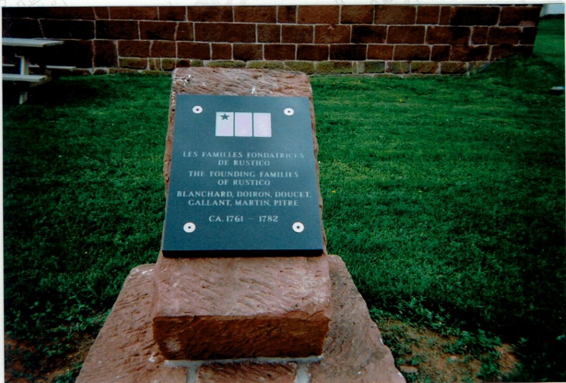
Monument Farmer's Bank, Rustico