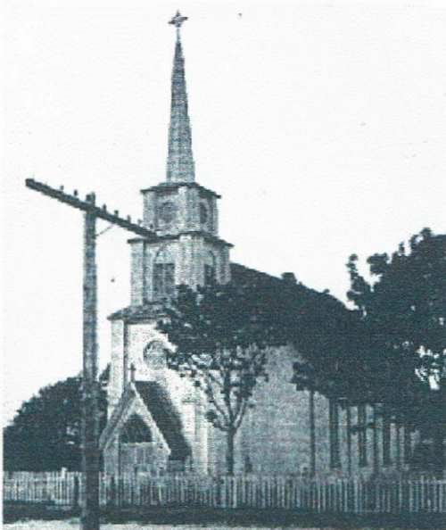
St Alexis Church built 1853