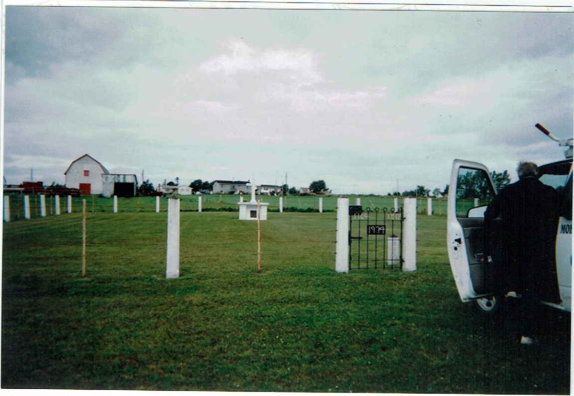
Rustico Pioneer Cemetery