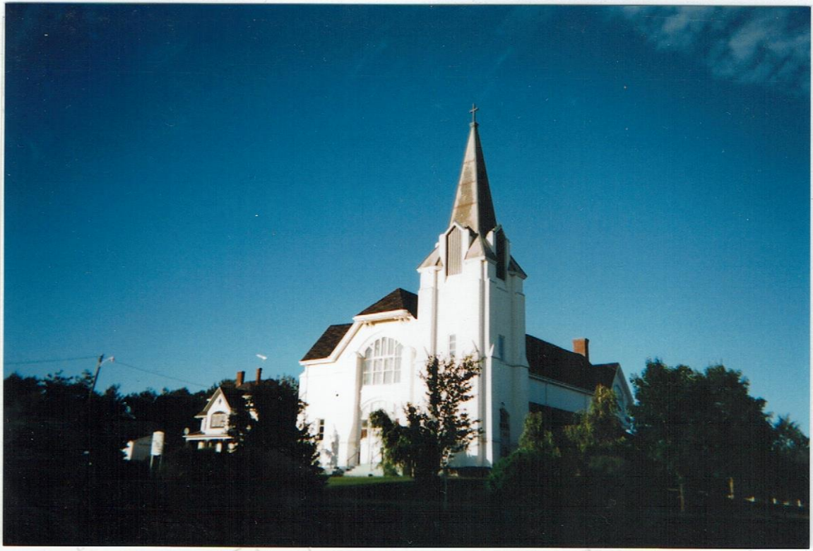
St. Margaret's R.C. Church St. Margaret's