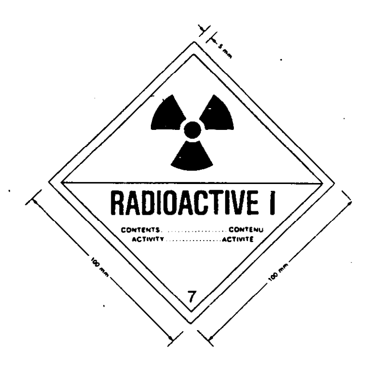
FIGURE 2 Category I—WHITE Label