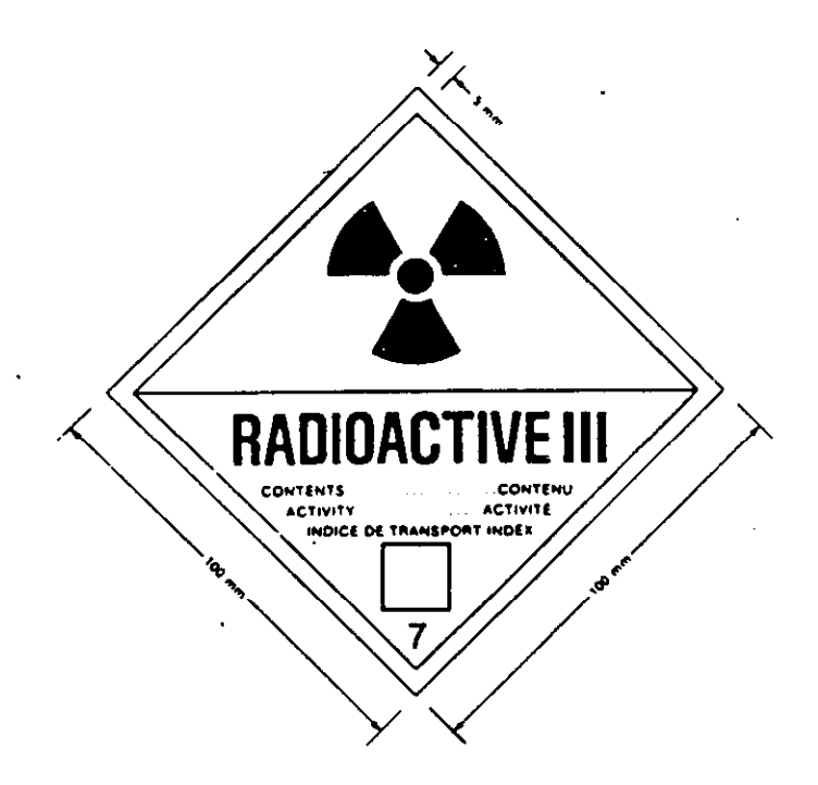
FIGURE 4 Category III—YELLOW Label