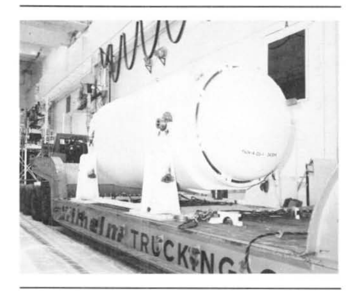
Figure 3: The second storage cask (TN-24P) built by Transnuclear, Inc.

term monitoring and testing of this cask was completed in September 1985.