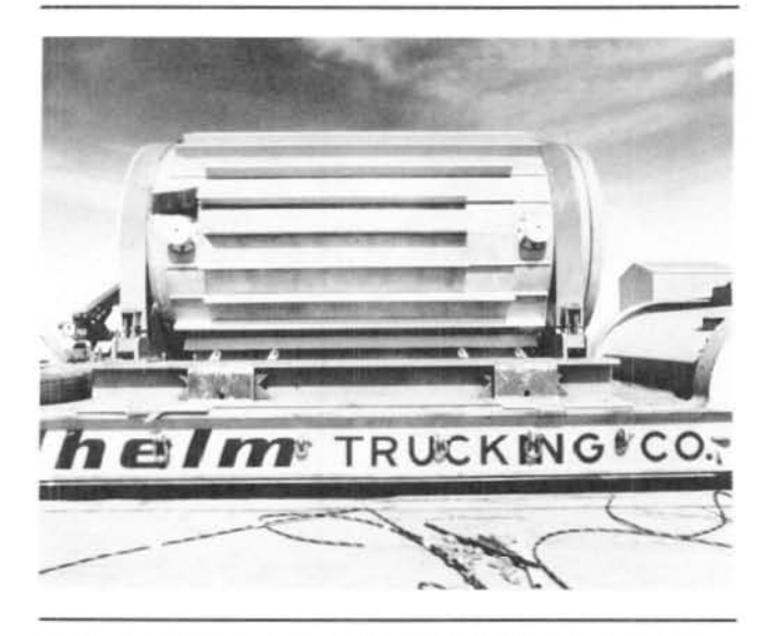
Figure 4: The third storage cask (MC-10) built by Westinghouse Electric Corporation.

The third storage cask, the Westinghouse Electric Corporation MC-10 (Figure 4), was received in mid-